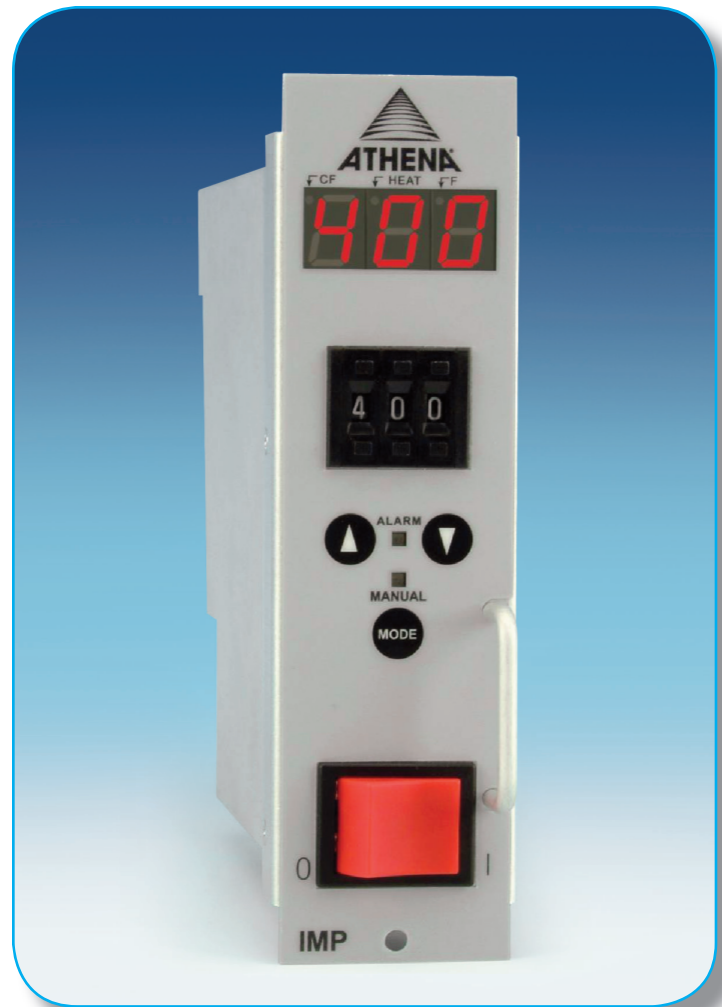
Fig 1. IMP Modular Controller showing single zone temperature control and 'thumbwheel' setpoint adjustment.