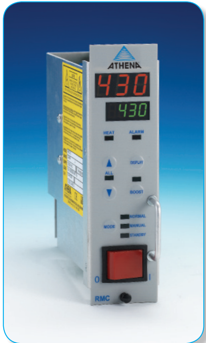
Fig 1. RMC Modular Controller showing single zone temperature control.