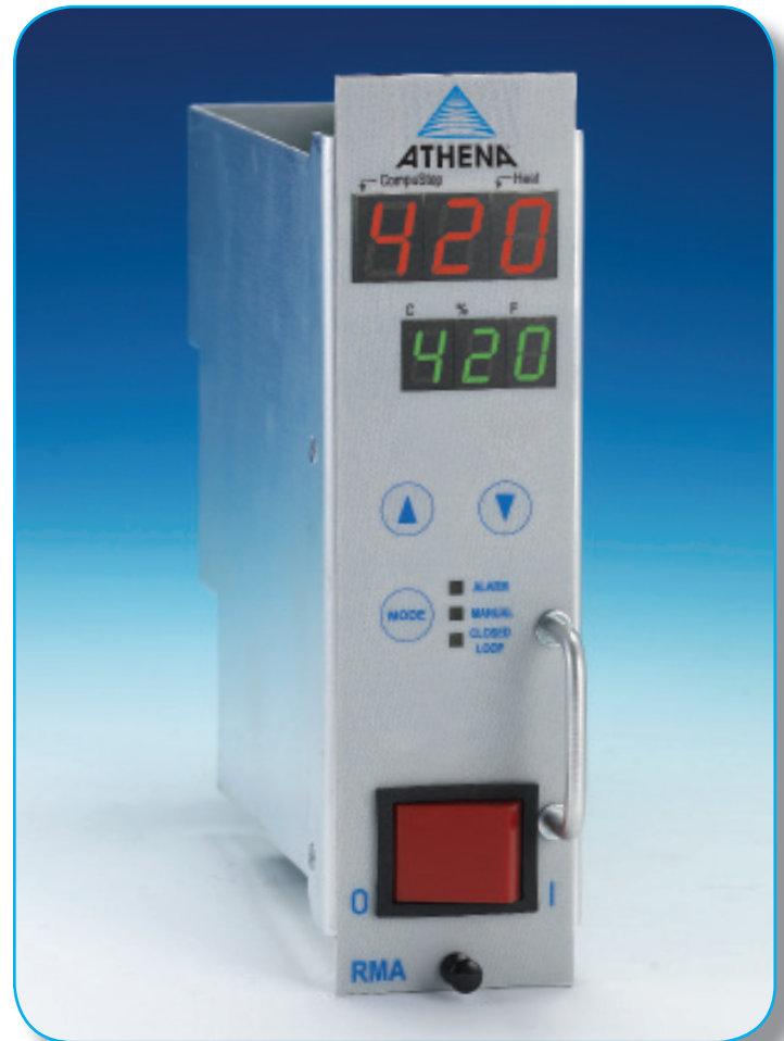
Fig 1. RMA Modular Controller showing single zone temperature control.